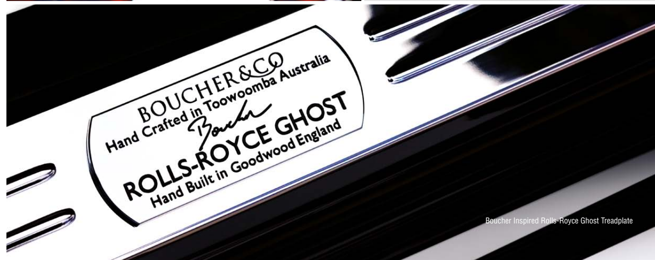
Boucher Inspired Rolls-Royce Ghost Treadplate